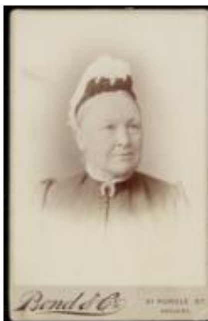
Catherine Helen Spence